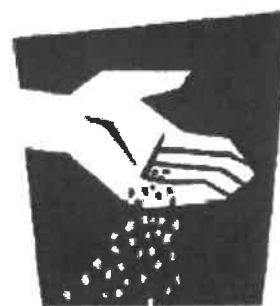
Mustard Seed Faith

This puzzle is based on Luke 17:5-6 (NIV)